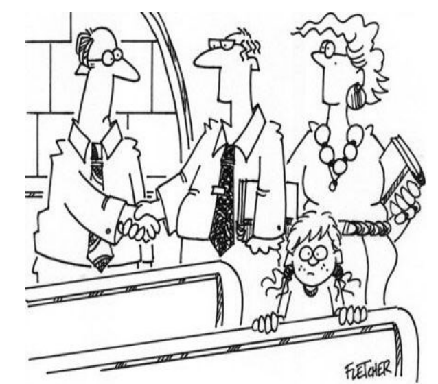
"We're looking for a church with a vibrant, active congregation... that we can quietly observe from the back pew."